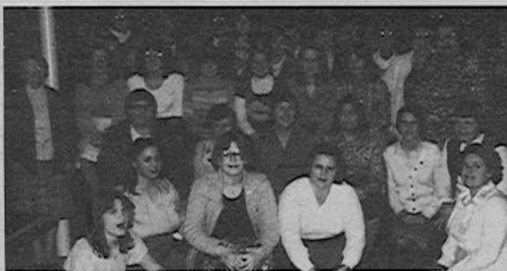
Members, Supervisors, Daddies, and Friends of Lilac Triangle #121.