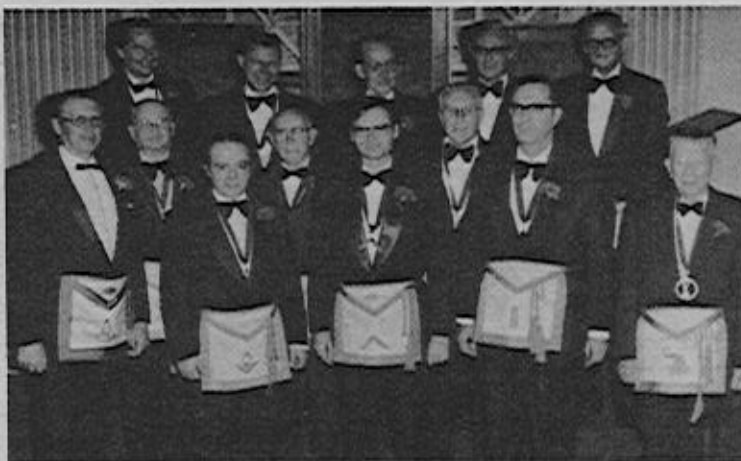
OFFICERS OF ROCHESTER LODGE #660 F. &amp; A. M.

On Premise Casket Showroom Parking for Over 70 Cars