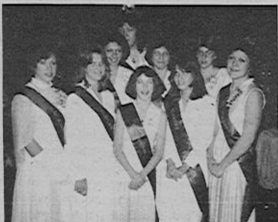
The Officers of Fidelity Triangle